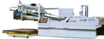
~ Rotary Die Cut Stacker ~