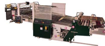
~ Rotary Die Cut Stacker ~