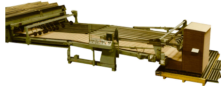
~ CorrStack ~

The figure to the right shows a typical serial number nameplate that is typically located on the primary power cabinet of the machine.