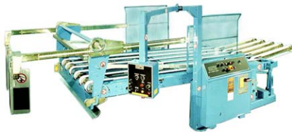
~ Press Stacker ~