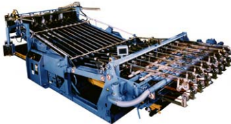
~ Rotary Die Cut Stacker ~

Geo. M. Martin Stackers are normally found behind a Rotary Die Cutter, Printer Slotter ,or at the end of a corrugator. Below shows what your Geo. M. Martin Stacker may look like